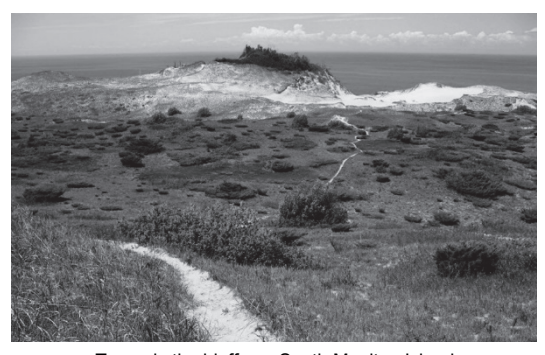
Towards the bluffs on South Manitou Island

The Popple Campground at the very north end of the island provides a shortcut for those not wishing to continue along the beach. Otherwise, if continuing on to Gull Point and around the bay, take care to find the bypass path about ½-mile beyond the short section of north-facing dunes, because Gull Point is literally "for the birds" and off limits to humans. It's a protected nesting place for the island's Herring and Ring-Billed gulls.