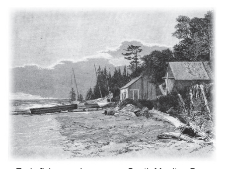
Early fisherman's camp on South Manitou Bay

1940 - 1970: island agricultural activity begins decline 1940's - 1950's: Exodus to the mainland leaves island essentially deserted by early 1950's.