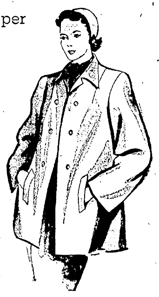
COATS — MAIN FLOOR

The first shipment sold out immediately and we had requests for more! Here they are! . . . casual toppers to wear over everything from slacks to formals. Smartly tailored of rayon sheen gabardine that is crease resistant. Fully lined, too! Pink, lilac, gold, beige, navy, red. Sizes 10 to 16.