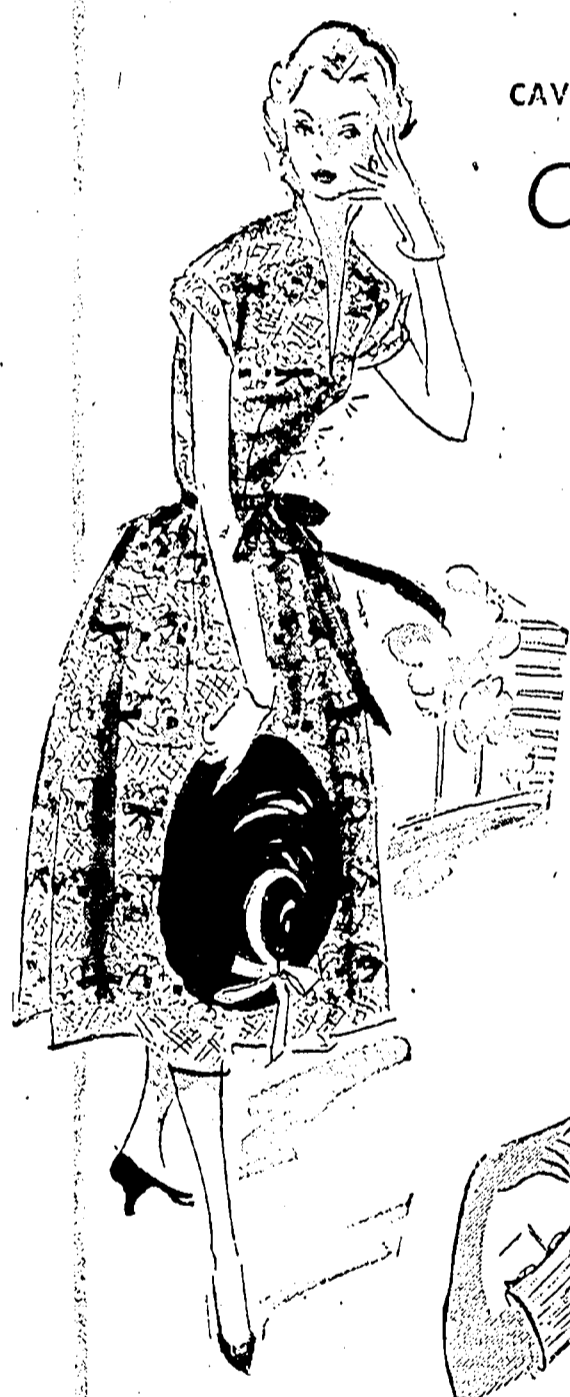
CAVALCADE OF COTTONS MAIN FLOOR

Fresh, new summer dresses . . . each one worth much more than its 5.95 price. An outstanding collection of styles for misses, women and juniors in plain colors, prints, plaids, checks! Some Bembergs, some maternities included. Sizes 10 to 20, 14½ to 24½, 9 to 15. Buy several of these in-season dresses at this sensational low price!